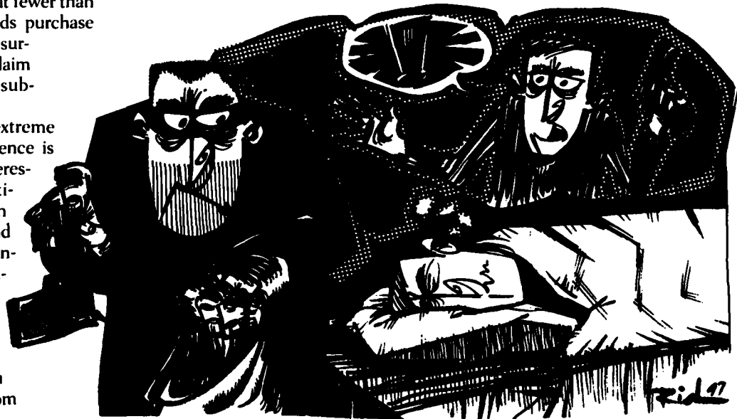
Cartoons courtesy of Richard Wentworth

The mean height from the mothers' reports was reasonably close to the mean height as measured by the experts. The variance of the heights was dramatically different, however. The estimate for the standard deviation of reported heights was more than double that for the scientifically measured heights, suggesting large "measurement error" in the mothers' reports.