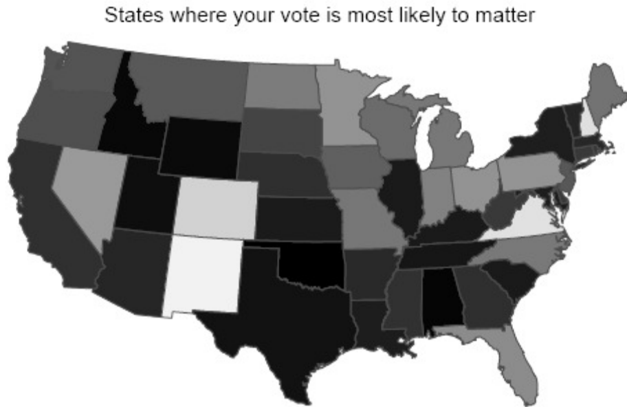
Figure 1. States with lighter colors are those where a single vote is more likely to be decisive. A single vote (or, for that matter, a swing of 100 or 1000 votes) is most likely to matter in New Mexico, New Hampshire, Virginia, and Colorado, where your vote has an approximate 1 in 10 million chance of determining the national election outcome. Alaska, Hawaii, and the District of Columbia are not shown on the map, but the estimated probability of a single vote being decisive is nearly zero in those locations.