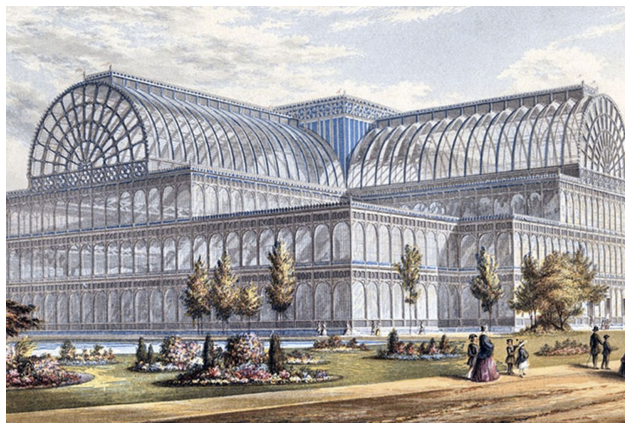
Figure 3: The Crystal Palace erected for the 1851 World’s Fair, which introduced the “opaque transparency” associated with the symbolic order of the modern museum.

plainly seen products and effects” (Preziosi, 2003, pp.96–97).