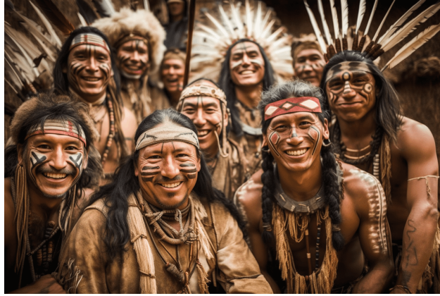
Figure 4: An image of smiling Native Americans generated by an AI (Gurfinkel, 2023).

future-directed point of view focused on the fate of a generic human identity, this type of indefinite reference to the more distant future of society is not so surprising. It is a consequence of aestheticizing generative AI and we should expect it, like its art historical equivalents, to serve some social-political purpose.