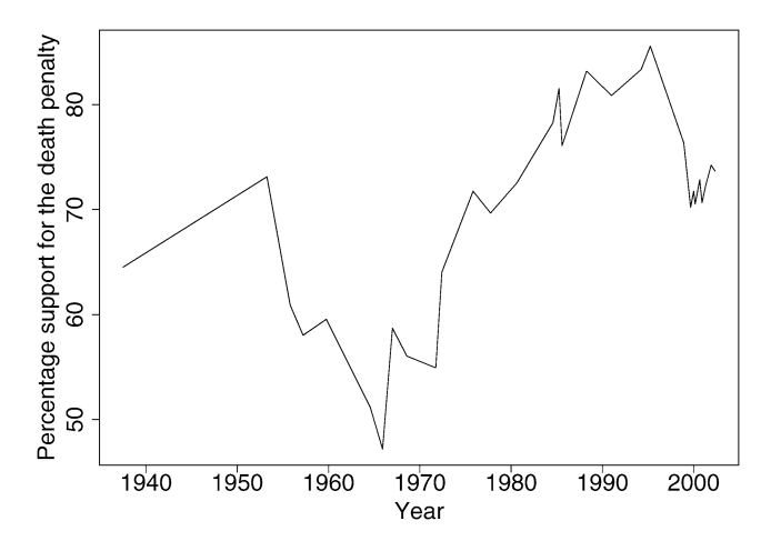
FIG. 1. The proportion of adults surveyed who answered yes in the Gallup Poll to the question, "Are you in favor of the death penalty for a person convicted of murder?" among those who expressed an opinion on the question. It would be interesting to estimate these trends in individual states.

divided by the proportion who will support the Republican; it is straightforward to move from estimating a population mean to estimating this ratio, as discussed in the context of this example by Park, Gelman and Bafumi (2004)]. We would also like to use series of national polls to estimate state-by-state time trends, for example in the support for the death penalty over the past few decades. (See Figure 1 for the national trends.)